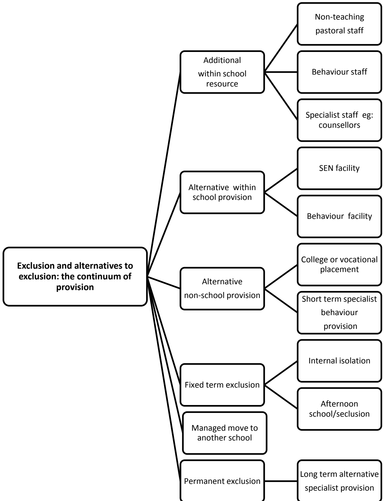
Figure 3.1 Exclusion and alternatives to exclusion: a continuum of provision