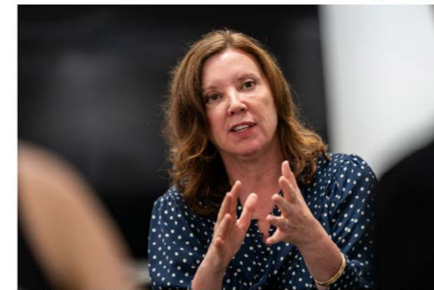
Children's Commissioner Dame Rachel de Souza has warned that children in youth custody were 'failed' by multiple services long before they offended