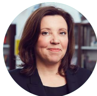
Dame Rachel de Souza Children's Commissioner